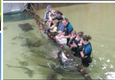
Irukandji Shark and Ray Encounters