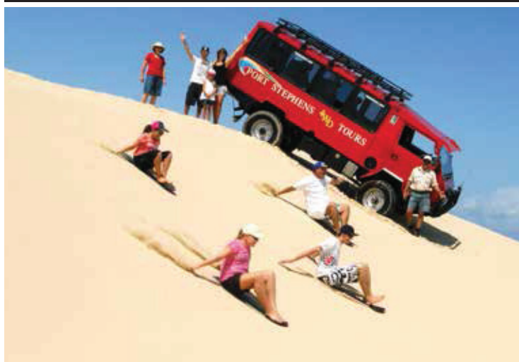
4WD sand dunes tour and sandboarding