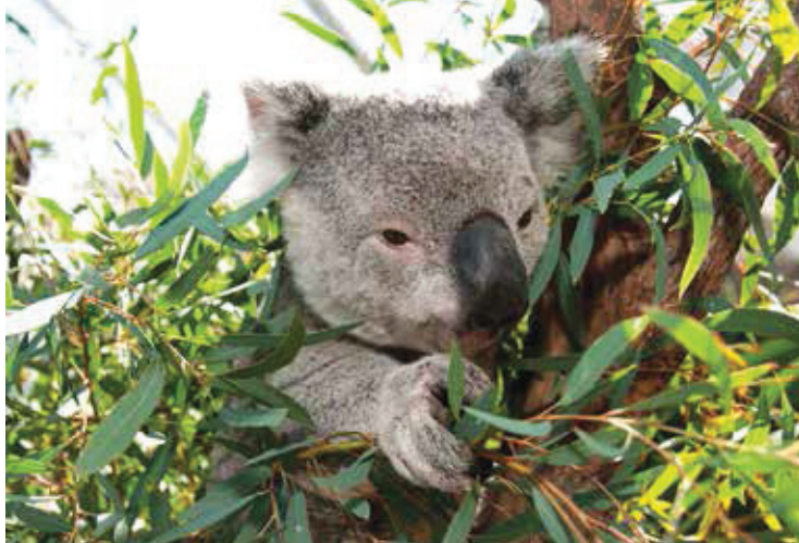
WILD LIFE Sydney Zoo